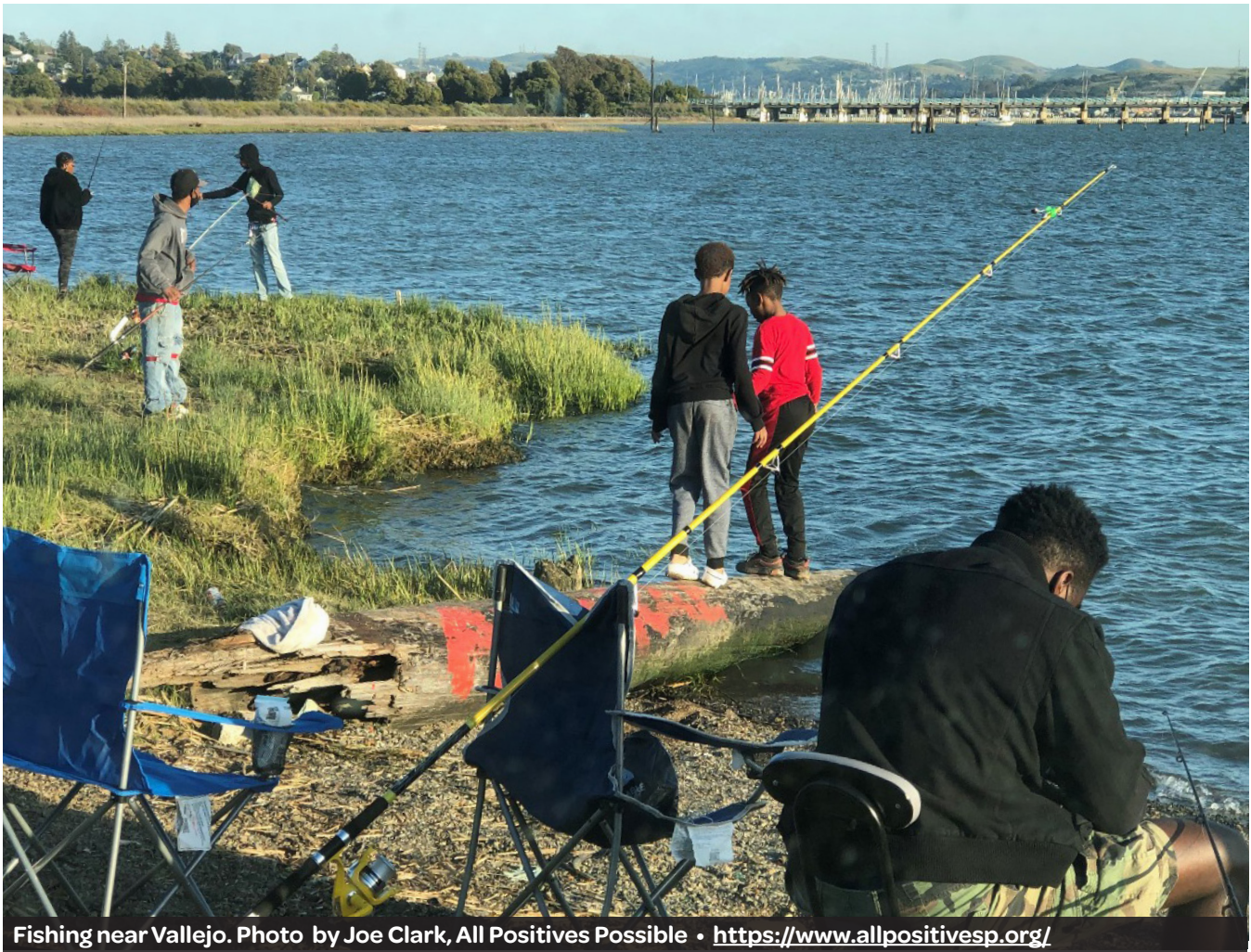
Fishing near Vallejo.