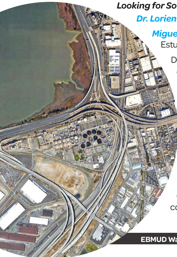
EBMUD Wastewater Treatment Plant

Phase 1 of the project examined wastewater influent (raw sewage), effluent (treated wastewater), and biosolids (digested sludge) from 12 representative municipal POTWs. Analysis of 40 PFAS at these municipal POTWs yielded comparable concentrations for the sum of PFAS, with median concentrations of 27 ng/L in influent, 58 ng/L in effluent, and