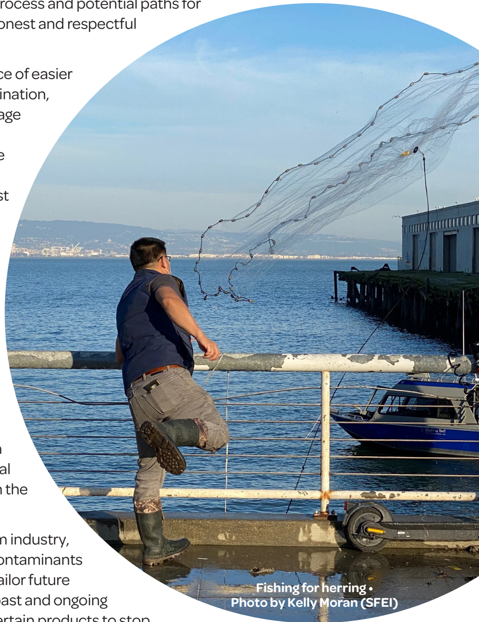
Fishing for herring

Although there is ongoing opposition from industry, source reduction is the key to reducing contaminants entering the environment and to better tailor future clean-up efforts. There are a number of past and ongoing efforts at the state level to ban PFAS in certain products to stop pollution and exposure at the source. A growing international movement to “turn off the tap” on PFAS is also important to limit global transport and exposure of PFAS. Some participants noted that at the state level, water and wastewater agencies are organized to obtain funding for PFAS related projects. Funding is also needed for impacted communities to lead their own science and education efforts. Others provided information about state efforts to limit PFAS use. For more information about these, contact aventura@cleanwater.org .