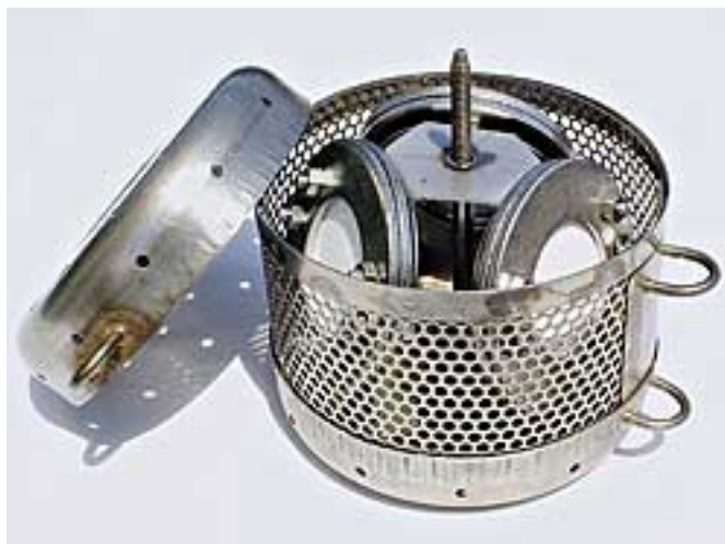
Figure 1. Deployment holder featuring one POCIS holder containing three POCIS. Dimensions 15 cm high x 16 cm wide. Environmental Sampling Technologies, est-lab.com

each of three sites, along with a field duplicate and a blank. Each grab sample will be shipped (on ice) to Dr. Ferguson’s laboratory at Duke University (NC) after collection for immediate extraction and analysis as described below.