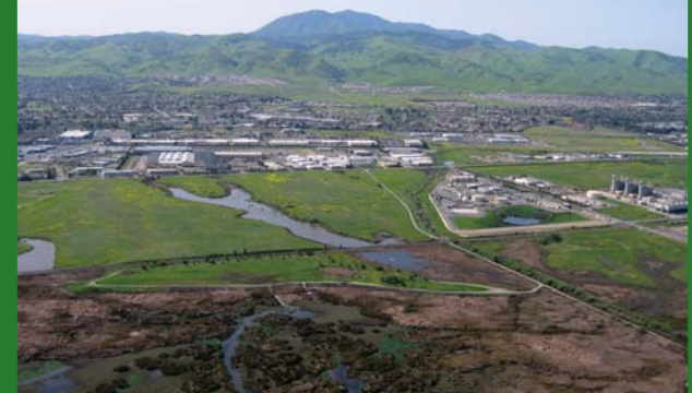
Connections to the Delta

Bring a text-enabled phone to participate in live polling throughout the day.